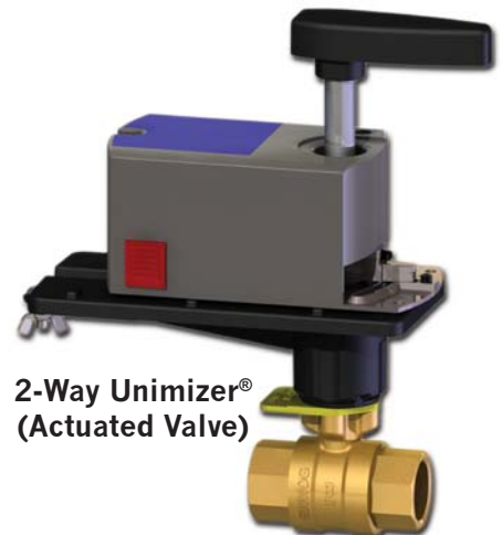
2-Way Unimizer® (Actuated Valve)