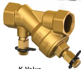
K Valve (Automatic Flow Limiting Valve)