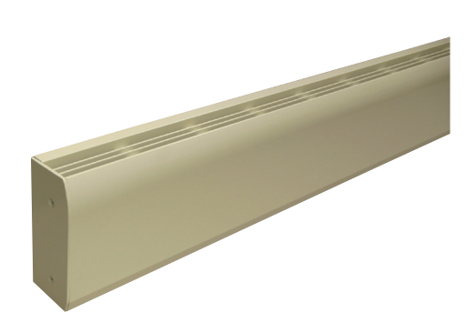
Bottom inlet unit is only 2-3/4 in. wide by 6 in. tall. Can be mounted to wall (3 in. above floor) or in front of window mounted on pedestals.