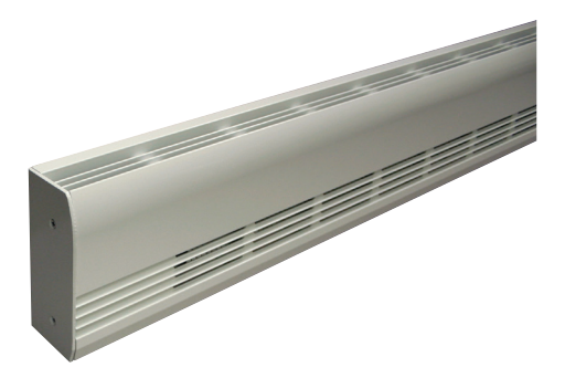
Front inlet unit is only 2-¾ in. wide by 6 in. tall. Can be mounted to wall or directly to floor.