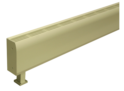
Hollow pedestals are 3 in. tall and allow concealed wiring access when stubbed through concrete floors.